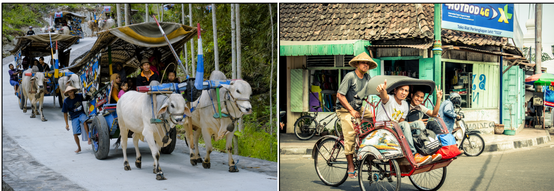
Figures 6 & 7: Examples of more traditional forms of transport, an ox-drawn cart and a becak